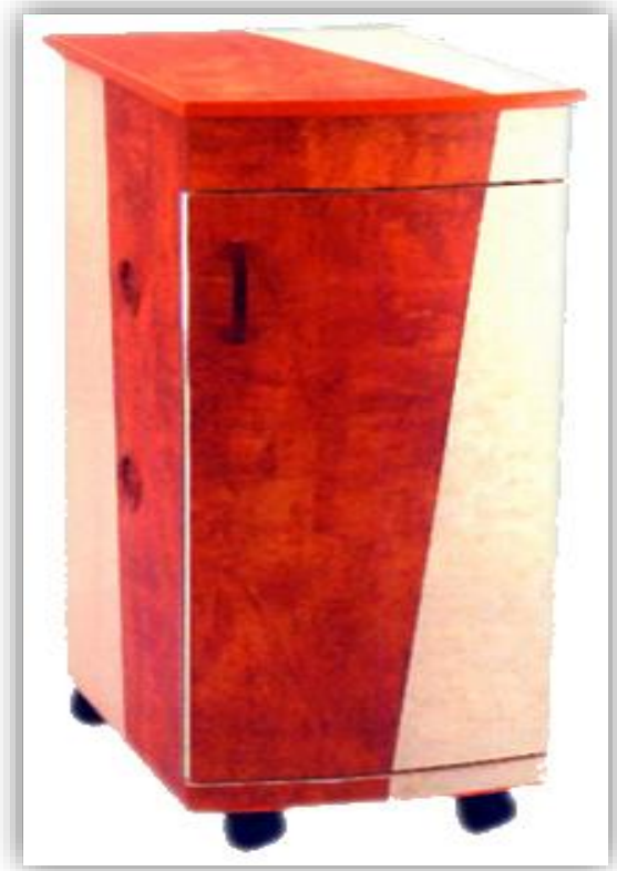
Model No 011