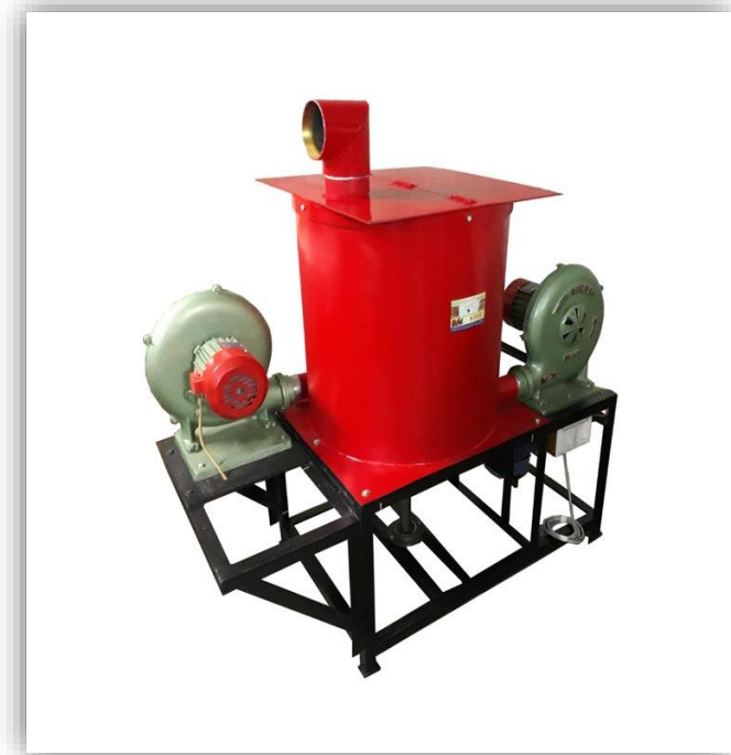
Model No 013